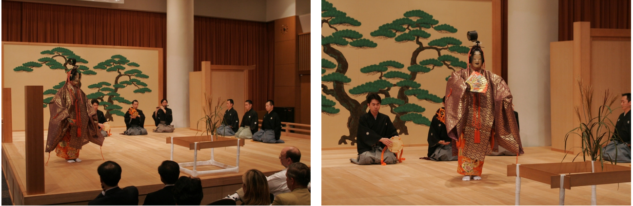
Figure 3: Pictures from a Noh dance. The performer (called Shite ) dances on the square stage. There are musicians and singers on the back and left on the stage, respectively. Sometimes there are additional performers (called Tsure and Waki ).

Here are additional images to help understanding Noh dance (Figure 3 and 4).